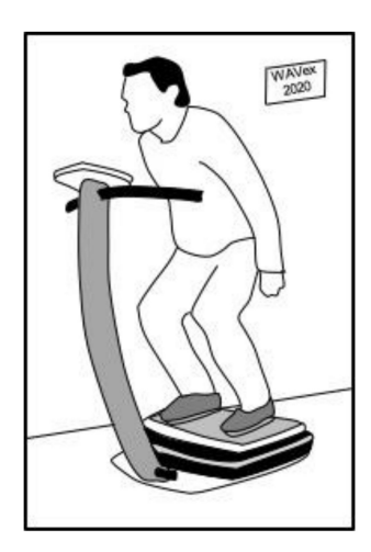
Figure 1. Conventional squat exercise on a WBV platform [54].

particularly unstable. Furthermore, the approach also relieves the necessity of close contacts with the patient, thus potentially reducing the spread of infectious diseases.